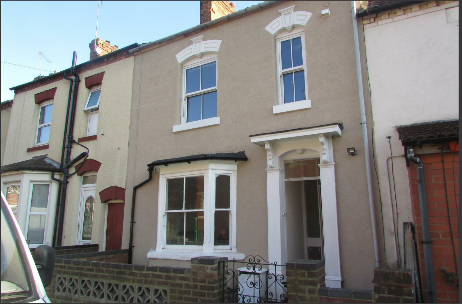
40 Mill Road, Wellingborough NN8 1PF £500 PCM